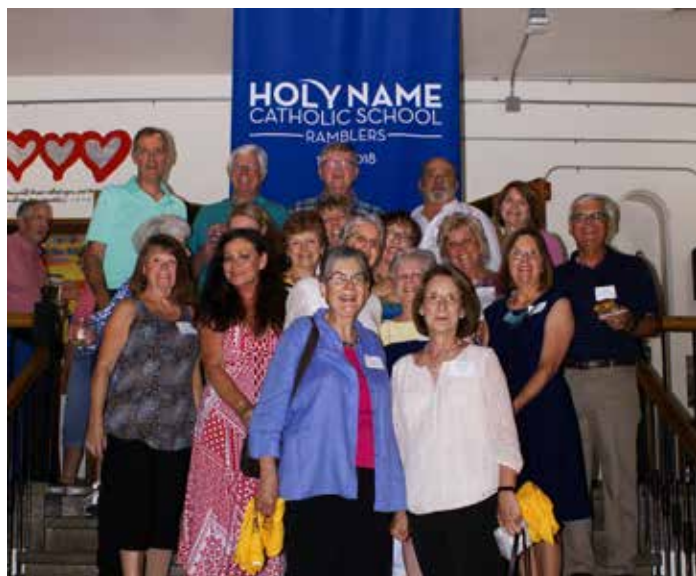
The Class of 1968 celebrates 50 years!