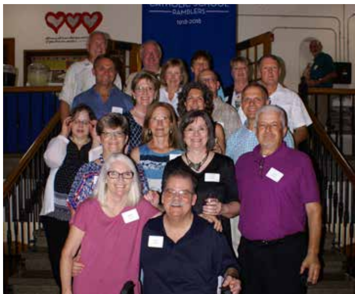
The Class of 1973 celebrates 45 Years!