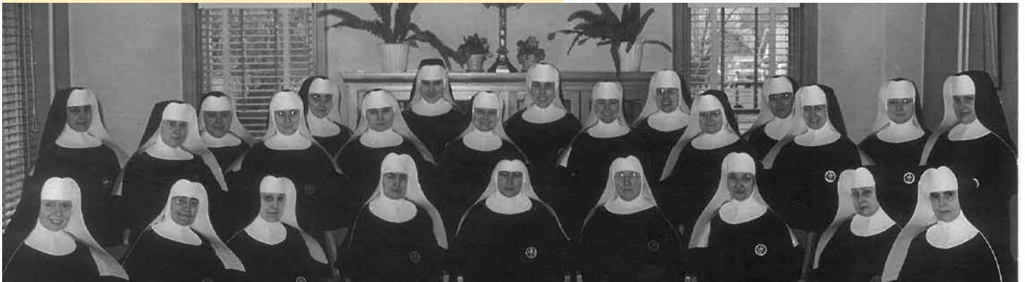
The Holy Name Community of Servants of Mary in 1954

Watch for more exciting news on the 100 year celebrations via the Rambler, email and the bulletin.