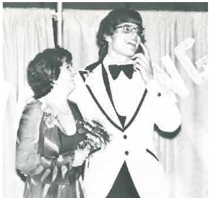
Class of 1977