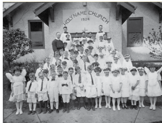
First permanent Church 1924