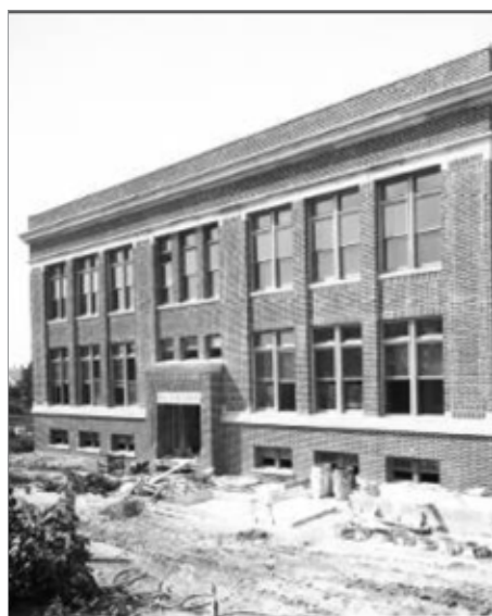
First permanent School Building 1921