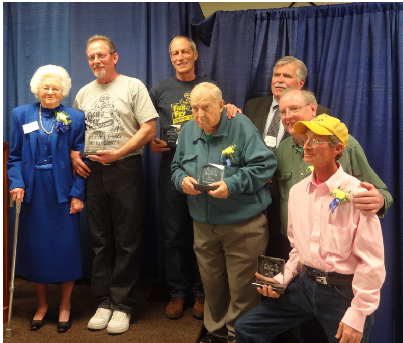
2013 Hall of Fame Inductees accept their awards