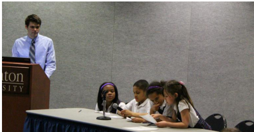
Third graders debate at Creighton University

In April, the Holy Name third and fourth graders traveled to Creighton University where they were treated to a buffet lunch in the cafeteria with Creighton students before beginning their debate against the Creighton University Philosophy Department Honor Students. The fourth grade debated against the Phi Sigma Tau students on the topic: "Should we de-extinct animals?" The third grade debated the fourth grade on the topic: "Should every child be required to wear a uniform in school?" Finally the third grade debated the Phi Sigma Tau students on the topic: "Books or television, which benefits us more?" The third grade and the fourth grade out debated the Phi Sigma Tau students and the third grade won the debate against the fourth grade. Way to go!