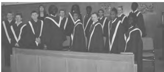
Holy Name School Student Mass Choir