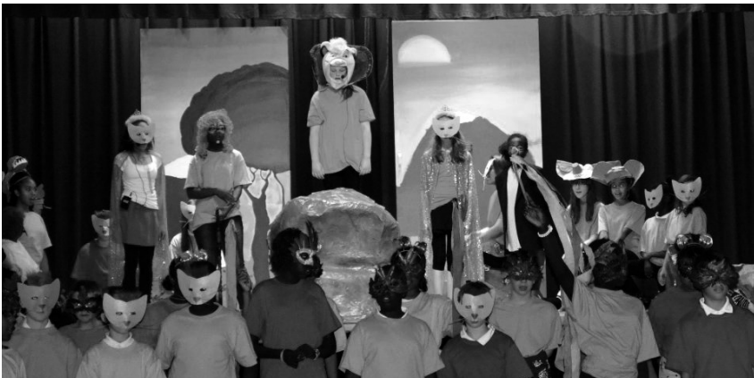
Students perform in the Lion King

The spring musical, "The Lion King," was performed by the 5th through 8th grade students. The students were involved in every aspect of the production including performing, set design and stage crew.