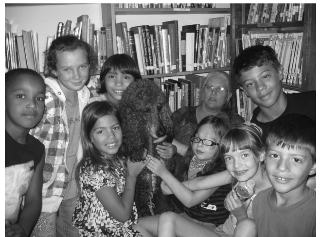
Students participate in the Summer Reading Program

About thirty students spent two weeks of their summer at Holy Name School practicing their reading skills as part of the Summer Reading Program. The program brings dogs to the classroom as an audience for the student readers.