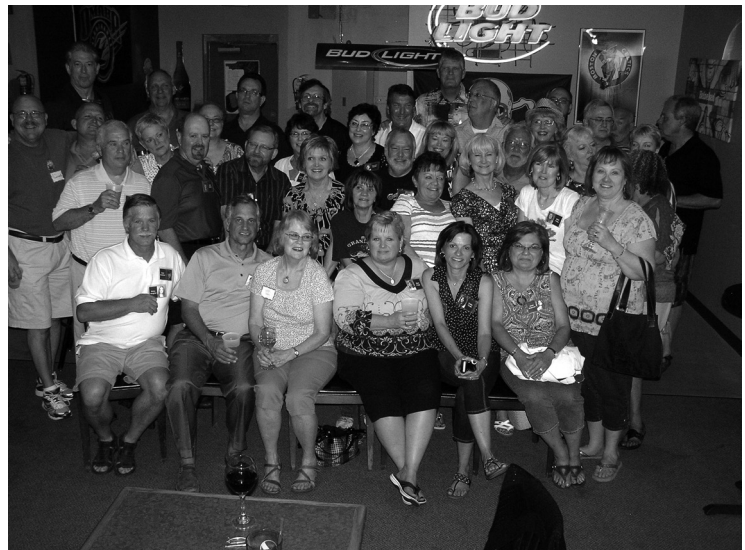
Class of 1972 celebrates Reunion Weekend at Clancy's