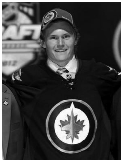
Jacob Trouba is drafted to the Winnipeg Jets