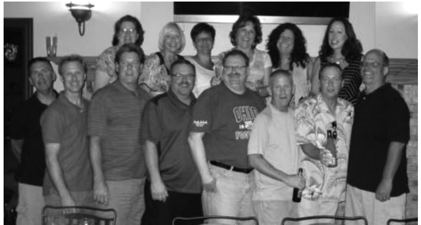
Class of 1977 Reunion at Legends

On June 9th and 10th, hundreds of Holy Name School Alumni gathered together to celebrate milestone reunion years. Events around Omaha on Friday and Saturday included golf outings, cookouts, happy hour cocktails, and dinners out on the town. Sunday morning, all of the alumni came together for a celebration Mass. Everyone was enjoying the company, and as 10:30 neared, it became obvious that getting the alumni to their pews would be no small feat. The socializing continued after Mass with a reception in the cafeteria. Many of the alumni took advantage of the chance to revisit the school. The archive room was open and full of people going through yearbooks and reading old news articles. A few more wandered the halls sharing stories of scary nuns and high school pranks. It was a great opportunity to see old friends and remember all the good times had at Holy Name.