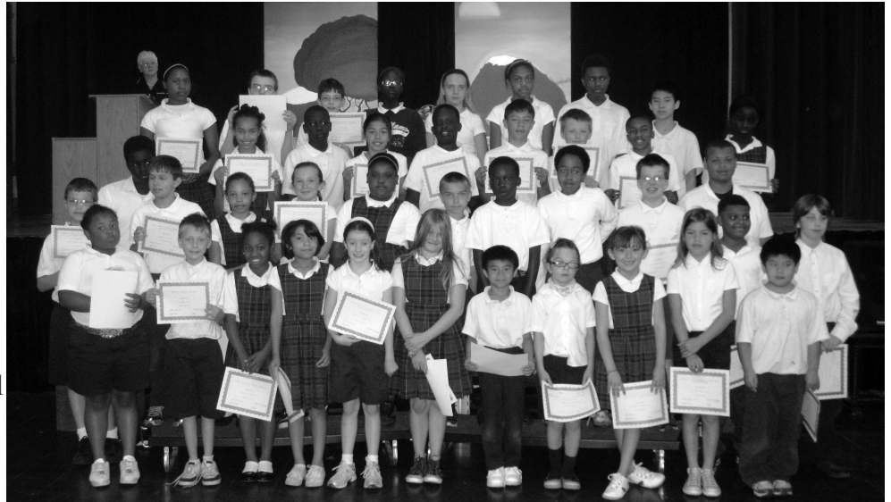
Students are awarded scholarships at the Honors Assembly

Holy Name School is proud to have forty-six Family Fund Scholarships to award this year. Thanks to generous donations from community donors, parishioners, clubs and alumni, the students of Holy Name have many opportunities to receive scholarships each year. The scholarships are awarded to students who strive for academic success and exhibit strong leadership skills throughout the school year. Congratulations to everyone who earned a scholarship this year.