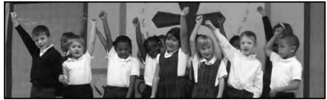
Pictured: Kindergartners raising their hands to praise God