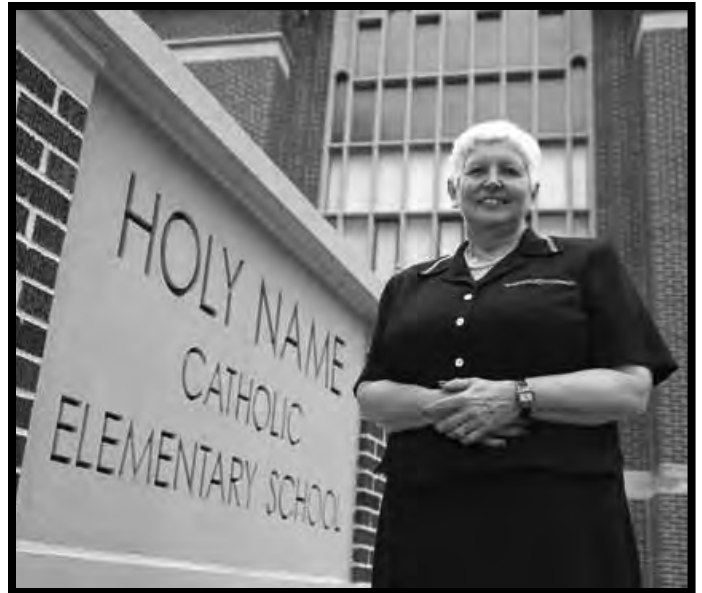
Creighton University: A Resource for Catholic Schools... see article on page 5.

For more news on Catholic Schools week, please see page 2.