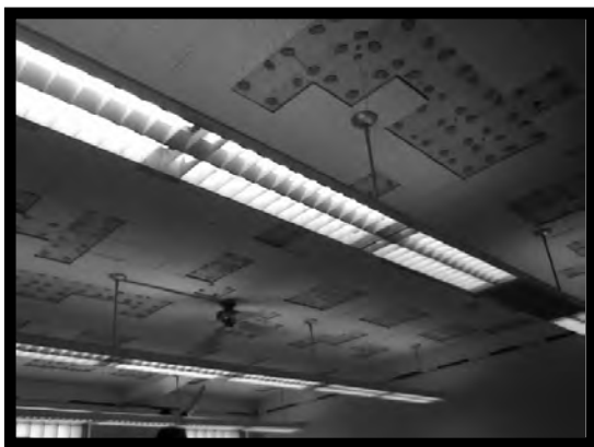
Left: Classroom prior to new ceilings and lights. Right: Classroom with new ceilings and lights

Recently an anonymous donor gave Holy Name a gift to do maintenance work in the school building . During the winter break the maintenance staff installed new drop ceilings and lights in the 7th and 8th grade classrooms. Students, staff and faculty are grateful for donations like these because it helps sustain our wonderful school, and also provides a better learning environment for our students.