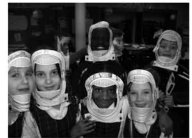
2nd graders designed their space helmets for their voyage