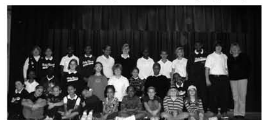
Talent Show participants