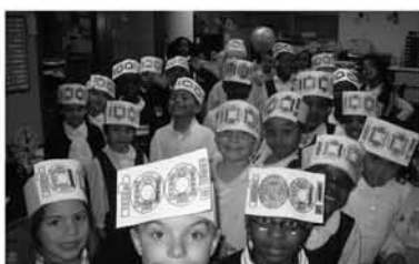
Kindergartners celebrate 100 days of school