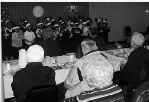
Kindergartners entertain the OK Group with songs and skits