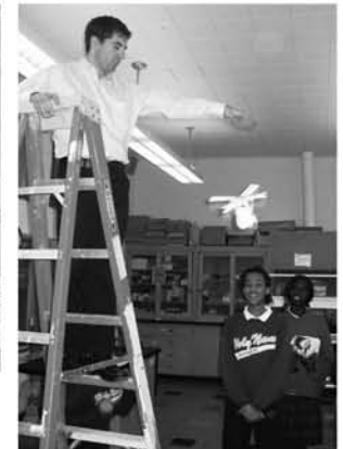
Egg Drop containers