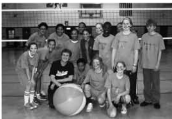
8th graders challenge the faculty to a volleyball game