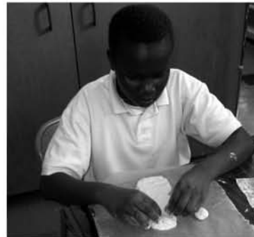
Making bread snowmen