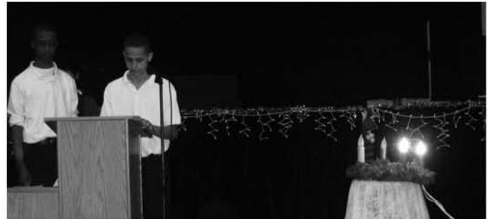
Each Wednesday in Advent a class took turns lighting the Advent candle

Academic lessons continued in a variety of ways. The 2nd grade began a unit on the solar system by designing their own spaceships and helmets for their "voyage." Then they spent a day on each planet throughout the weeks. The 7th grade used the Science lab to design "egg drop" containers. Several of the students were successful in preserving their eggs, even after a 10 foot drop!