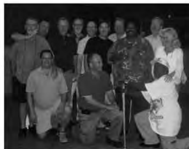
Class of 1979 Where are all the women?