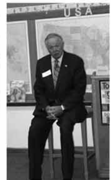
Mayor Mike Fahey