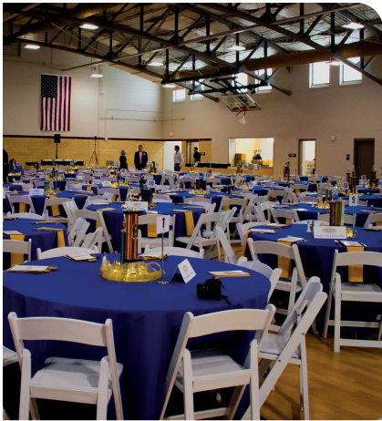
The new space is all dressed up to welcome alumni and friends!