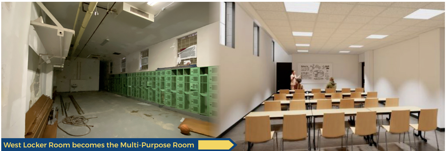
West Locker Room becomes the Multi-Purpose Room